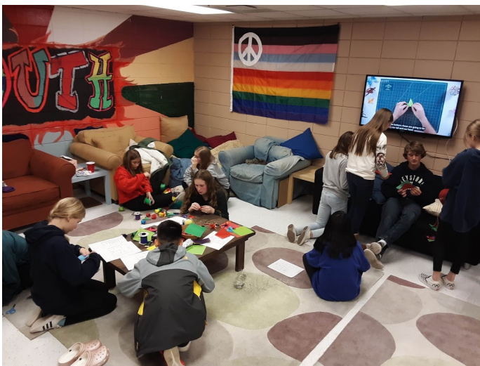
Youth working to create an origami mobile as a token of gratitude for a pillar of our community

We'll be preparing a Christmas Pageant for Dec 15 the next couple weeks during worship in our break out youth faith group. Plus, Saturday, December 7 is the annual Gift Making Workshop, 9:00 am-11:30 am. Come early and celebrate the season!