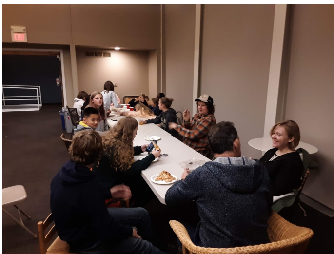
When more people show up for game night than you expect, what do you do? Make a longer table!