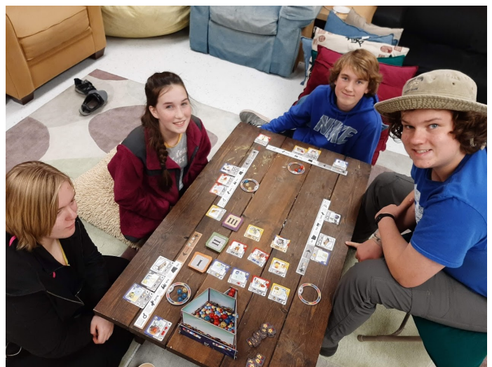
The senior high playing a game called Gizmos, where you build gadgets that link together to give you a massive sequence of chain reaction events