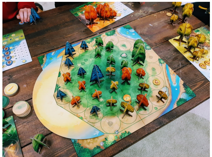
The junior high focus group played a beautiful game called Photosynthesis, where you get points for growing trees with a rotating light source