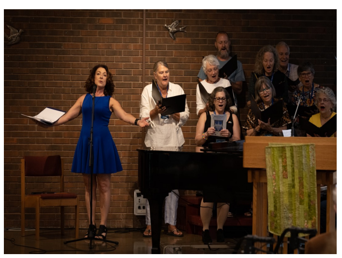
The story does not end here! Keep your senses attuned for a few more special offerings coming this fall, Les Misérables on Sep 24 and Frozen on Oct 29!