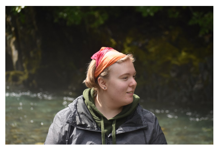
Hundreds of miles from home, we found peace unlike other. Thank You Juneau!