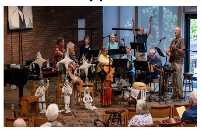
In the delicate balance between justice and peace, our folk group wove tales of understanding, inspiring a world where harmony and equality entwine.