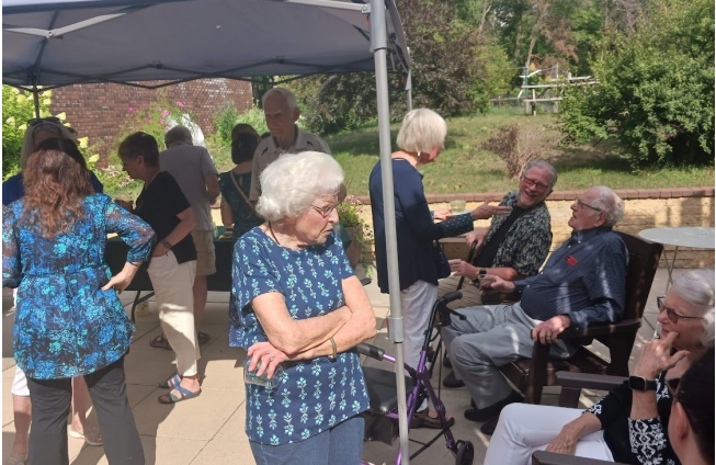
Here's to the ones who missed out - don't worry, we'll save you a spot for next year's happy hour extravaganza. But for now, let's cherish the memories we made, the jokes we shared, and the bonds we strengthened.